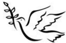
The Peace Crane